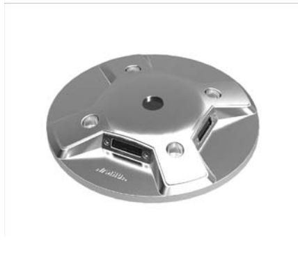
Dimension ( mm )