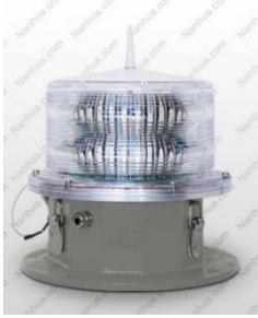
Dimension ( mm )