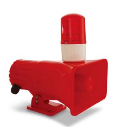
BC-3B with junction box