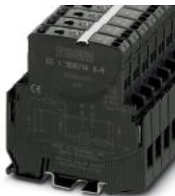
Electronic circuit breaker, reset input and status output, nominal current: 4 A

Please be informed that the data shown in this PDF Document is generated from our Online Catalog. Please find the complete data in the user's documentation. Our General Terms of Use for Downloads are valid ( http://phoenixcontact.com/download )