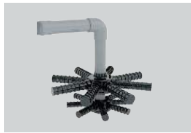
Dual Lateral System

with its 1.0m or 1.2m deep sand bed and dual laterals, offers an enhanced filtration and provides a high performance solution for residential and commercial pools and spas. It is UV-resistant and can operate under prolonged sunlight.