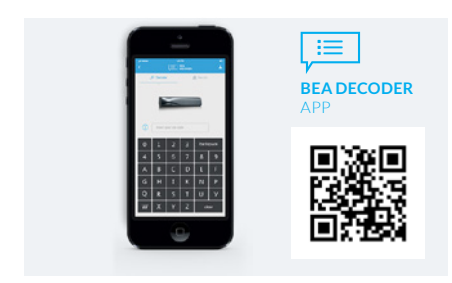
Downolad the BEA DECODER app