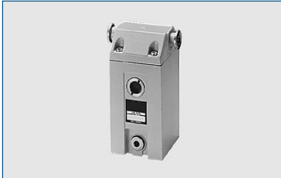
AK 4-8 condensate separator

Separators protect the pump against condensate.