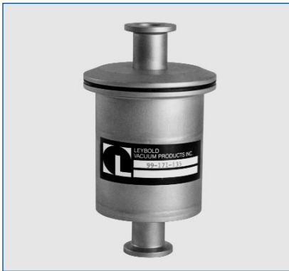
RST refillable trap

The RST traps are made from 304 stainless steel, and when specified with stainless steel filtration media, are fully suited for corrosive applications. The media is inserted directly into the trap. This ensures direct contact with the trap walls. There is no oil path between the trap wall and the retainer gasket to reduce trap effectiveness.