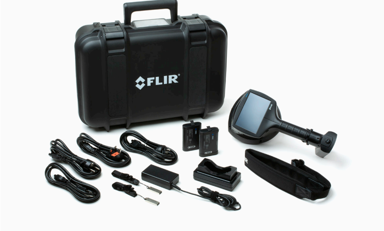
Included in the box