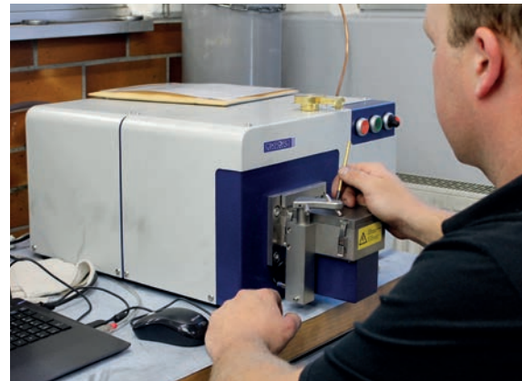
FOUNDRY-MASTER Smart in operation